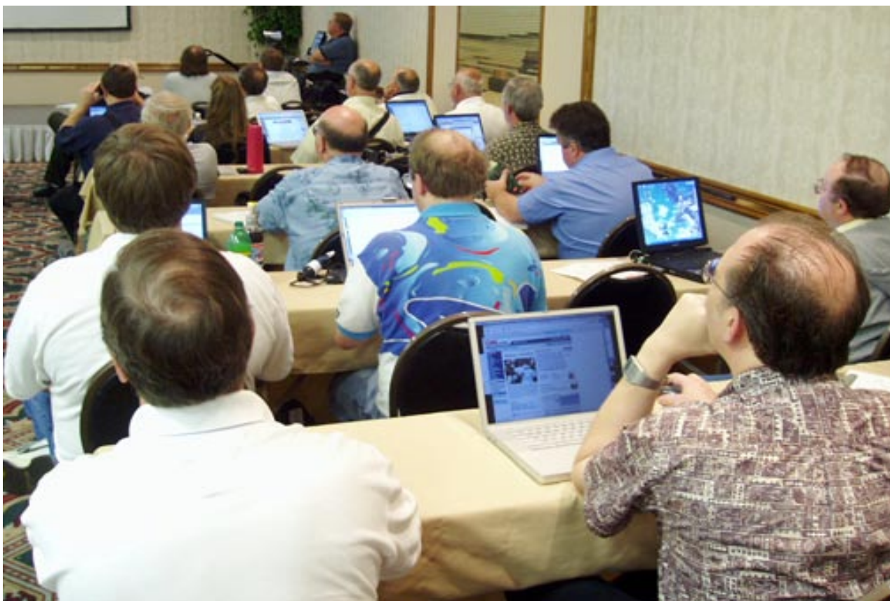
Laptops galore at the DCC.

The talk was an introduction to APRS. It started off with some cool uses I had put it to and then worked through the basics. Some of this, I admit, was a bit out of order, but it was good. People were asking the right questions. Having Internet access there was cute. I could demo some of the Internet services available.