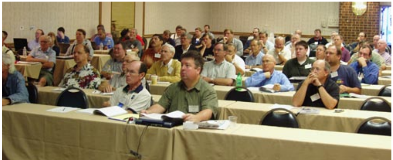
The audience is held spellbound at the DCC.

One of the reasons I wrote the paper was that he had made a statement about power control and spread spectrum many years ago and then made comments to the contrary later. I disagreed with these later statements and I needed to say why.