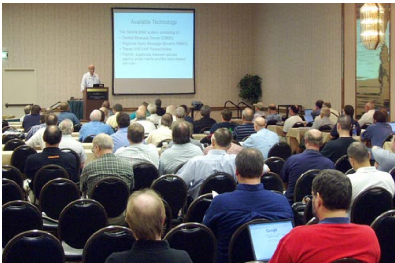
DCC Main Session Room. Wonder what the chap in red is Googling?

As bad as these flights are, they are a chance for me to catch up on all those movies I thought I might want to watch at the cinema