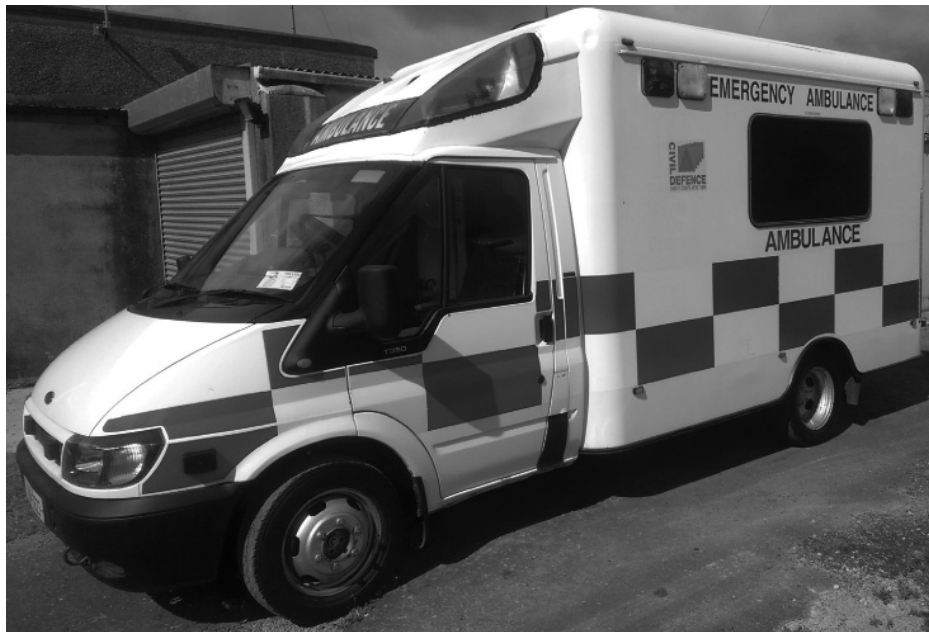
Fig. 11. Civil Defence Ambulance

It was decided as part of the trial to put the available units into two Civil Defence ambulances. These vehicles are identical to that in figure 11. It was decided to mount the Sigfox units in the area above the drivers head (behind the "Ambulance" lettering). The entire rear of the body of these types of ambulances are fibre-glass. So positioning the unit here keeps it out of the way of any personnel.