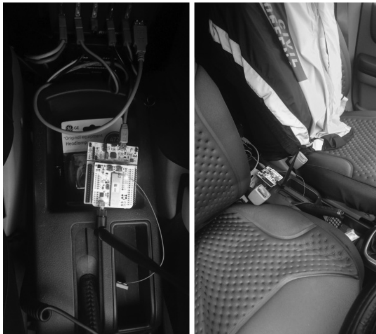
Fig. 9. Mounting location of the development board for initial tests.

The next stage involved it being placed into the vehicle of one of the authors and accompanying him on his daily commute.