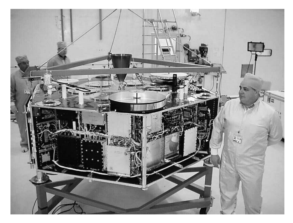
Figure 6 AO-40, over 500 Kg at launch.

And this led eventually to AO-40, a true monster.