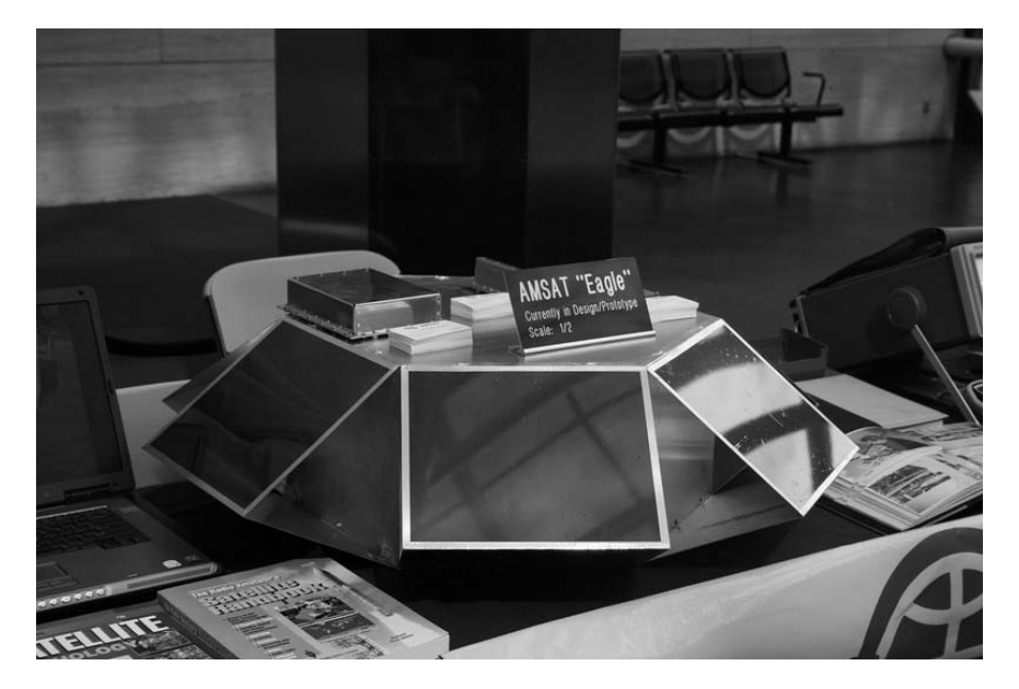
Figure 1 Eagle Model, 1/2 Scale

In AMSAT, it is déjà vous all over again. We have been working <u>SLOWLY</u> on Eagle for years, trying to find a way to get it into space. We have done a complete redesign of Eagle. We have put it into a space frame that makes mechanical sense and will allow us to address the many issues of delivering the SERVICES we want to deliver to our users as well as all of the new users we wanted to attract. We have a paper design of a fantastic digital communications system. It is designed to carry digital voice or digital video (depending on the size of your ground antenna). We call it the advanced communications payload rather than digital payload to help everyone distinguish it from our previous digital communications endeavors. We have assured ourselves of having power in all seasons and times of the year. This is provided by the fold out solar panels you see depicted in Figure 1. We have a solid complement of linear transponders provided by software defined radio transponders (hey, I am the boss after all!)