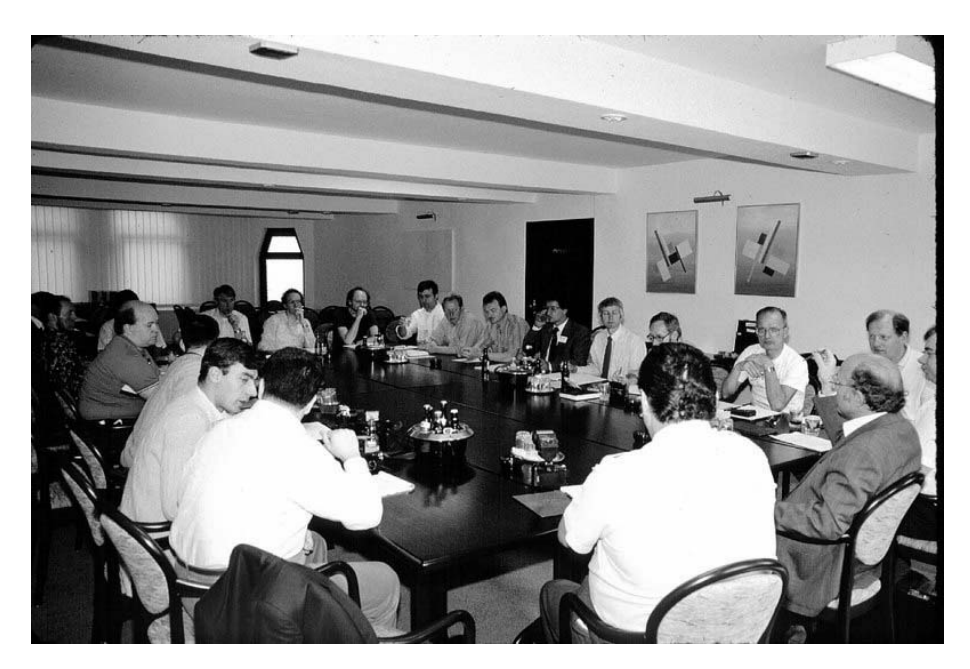
Figure 5 Phase 3D Design, Marburg, DL, 5/90

And this led eventually to AO-40, a true monster.