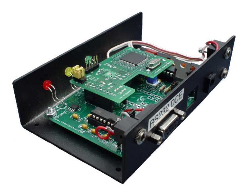
Figure 2. µSmartDigi and TNC-X

If a packet PASSes the Rules a new AX.25 HDLC frame is constructed, then a KISS packets is constructed and lastly it is sent to the serial port of the TNC-X for transmission.