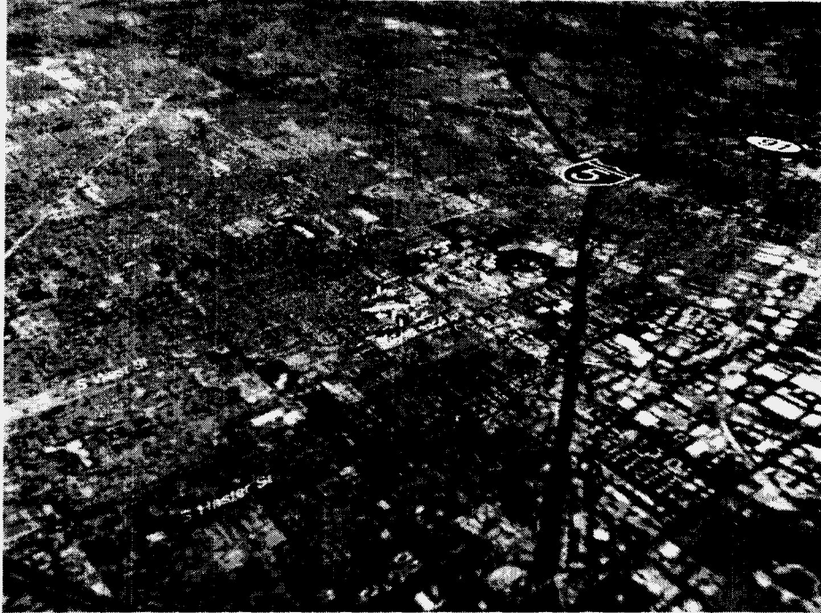
Figure 2 - LA before zooming into the venue